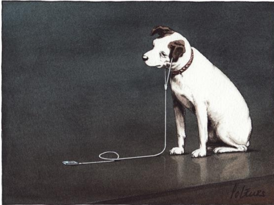
"His Master's Voice"